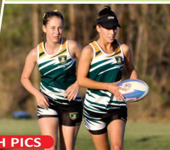
ALL SCHOOLS TOUCH PICS